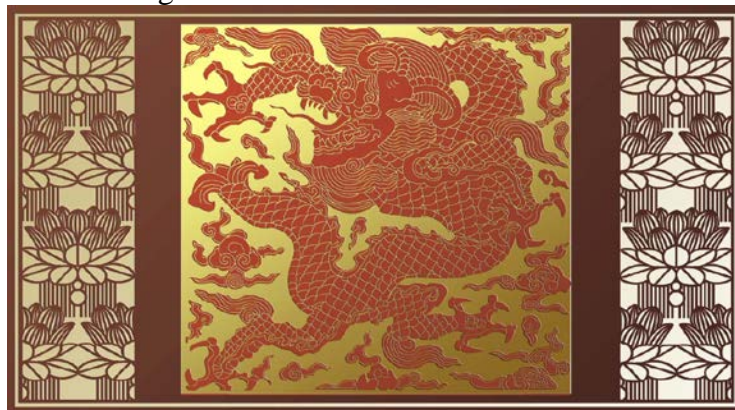
Fig.1.Decorative Painting “Cloud Brocade Dragon Pattern”

Fig. 1 is the decorative art design work of Nanjing Hall. The author combines Nanjing Yunjin dragon pattern and lotus lamp pattern in the design. Fig. 2 is the decorative art design work of Nantong Hall. The author draws lessons from the graphic elements of seven-star kite and blue printed cloth produced in Nantong.